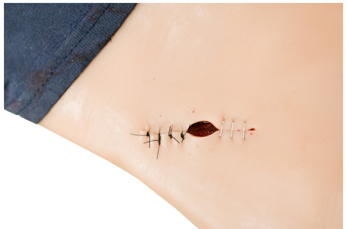
SUTURE / STAPLE PLACEMENT