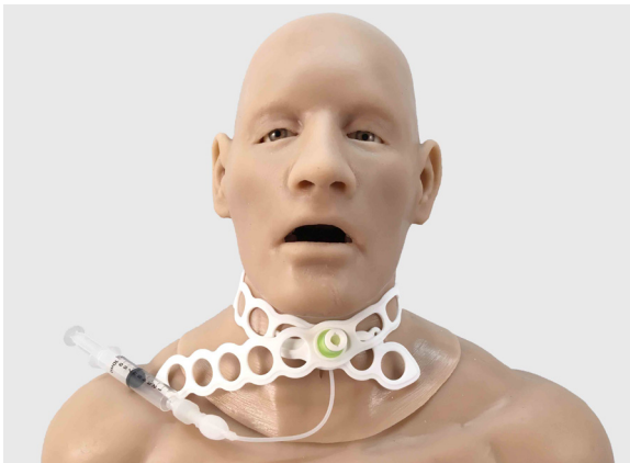
3: Surgical Airways (Cricothyroidotomy, Cricothyroidcentesis, etc.)