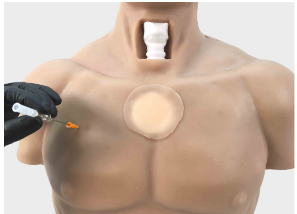
4: Chest Needle Thoracentesis