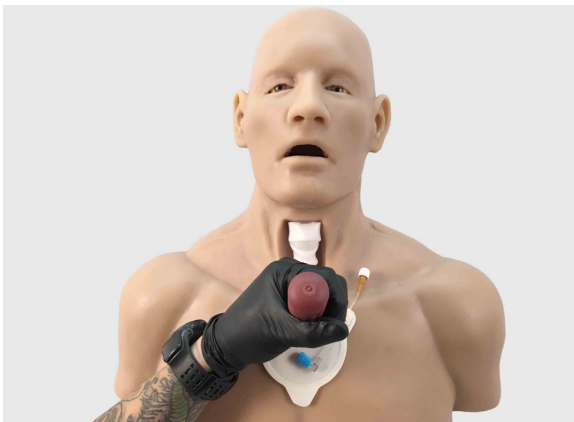
5. Sternal Intraosseous Catheter Insertion