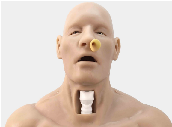
1: Nasopharyngeal Airway (NPA) Adjunct Insertion (with oropharyngeal visual confirmation of proper measurement and placement)