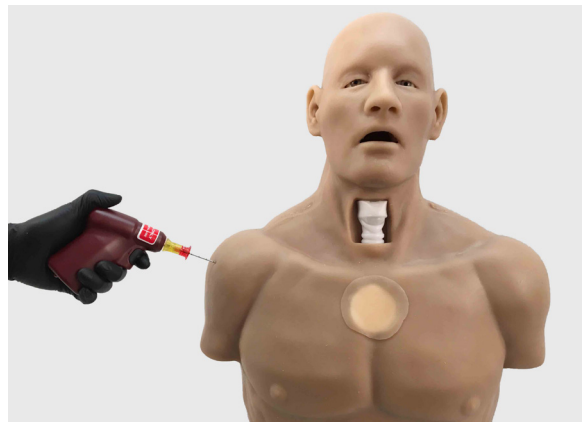
6. Proximal Humerus Intraosseous Catheter Insertion