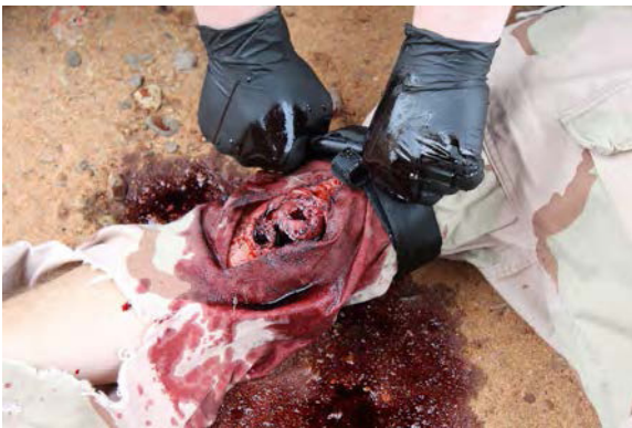
Tourniquet application to an upper extremity life threatening bleed