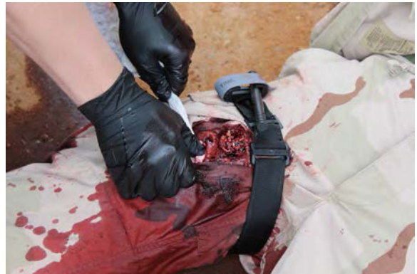
Packing of a lower extremity life threatening bleed