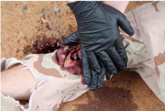
Internal hemorrhage compression applied to an upper extremity life threatening bleed