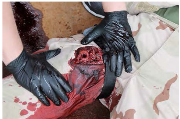
Tourniquet application to a lower extremity life threatening bleed