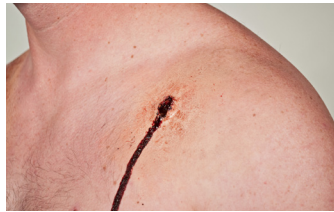
Gunshot Entrance Wound