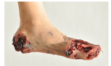
Partial Foot Amputation