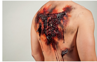
Penetrating Shrapnel Wounds