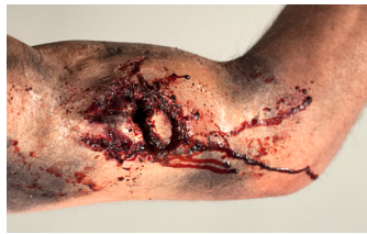
Compound Humerous Fracture