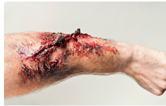
Forearm Laceration with Shrapnel