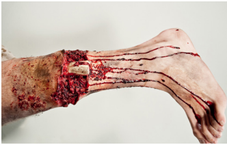
Compound Fibula Fracture