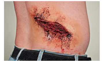
Superficial Large Laceration