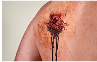
Gunshot Exit Wound