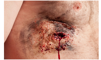
Sucking Chest Wound