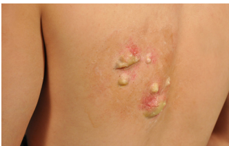
2nd Degree Partial Thickness Burn