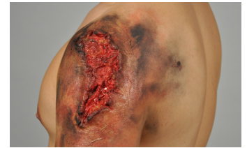
Upper Extremity 3rd Degree Burn