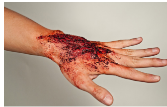
Dorsal Hand 1st & 2nd Degree Burns