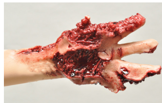
Partial Hand Amputation