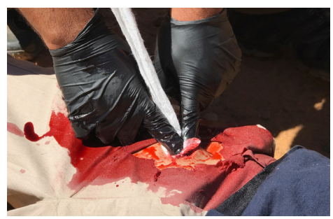
Packing the wound using gauze